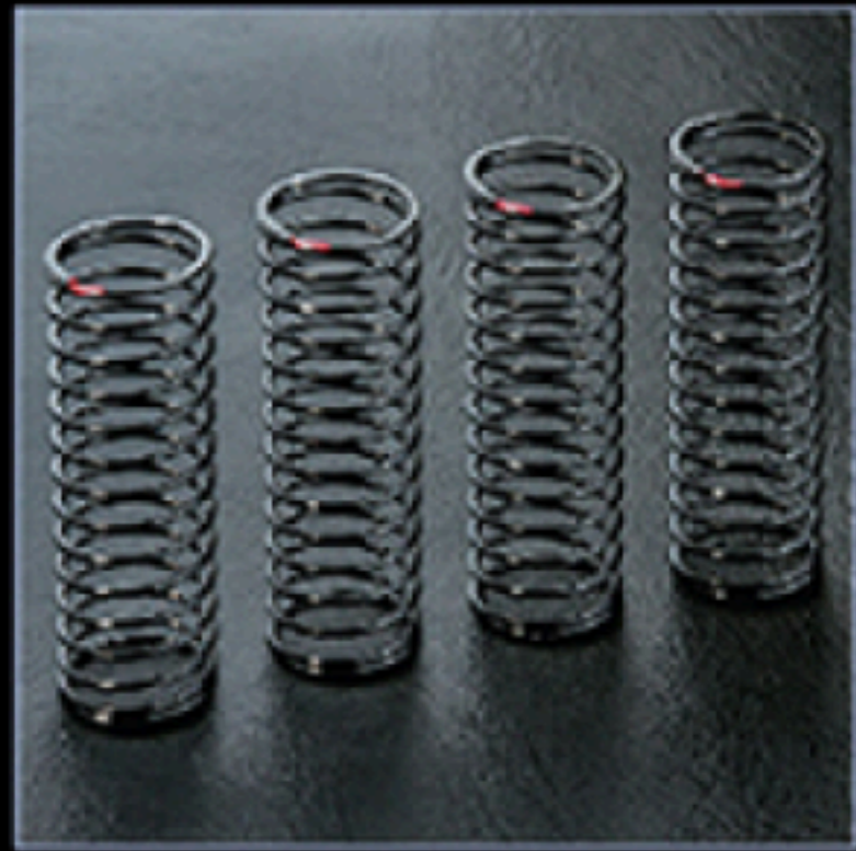
Coil spring 45mm (soft)(red)(4) 避震彈簧 45mm (軟)(紅)(4)