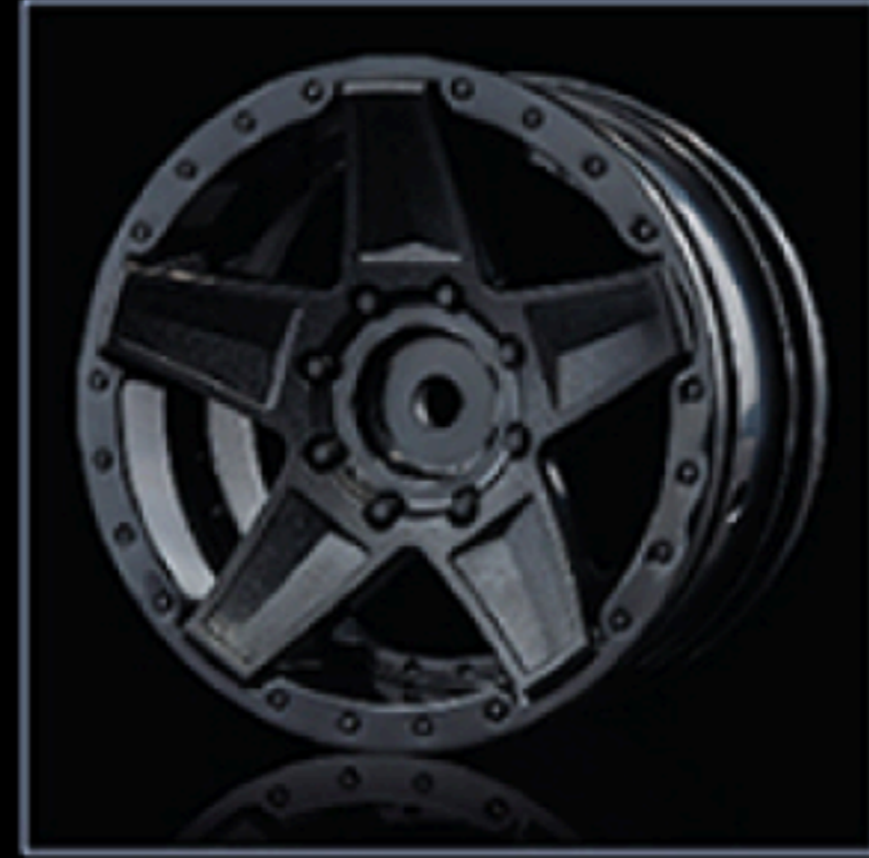
Black 648 1.9" wheel (+5) (4) 黑色 648 1.9" 輪框 (+5) (4)