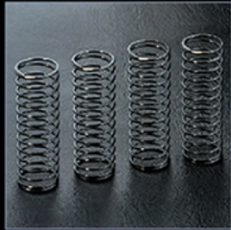
Coil spring 45mm (medium) (gold)(4) 避震彈簧 45mm (中)(金)(4)