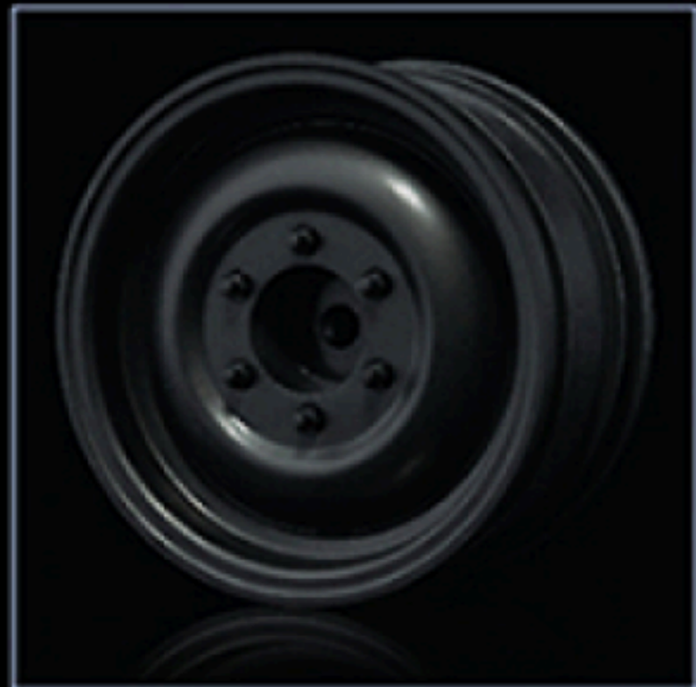
Black flat 60D 1.9" crawler wheel (+5) (4) 黑色消光 60D 1.9" 攀岩框 (+5) (4)