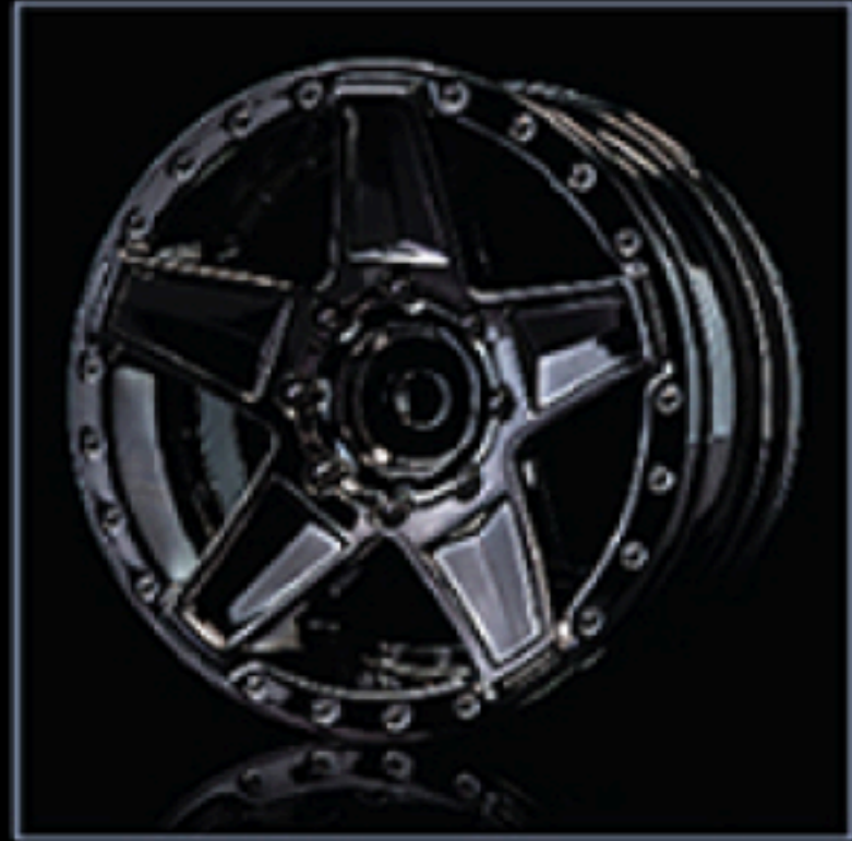
Silver black 648 1.9" wheel (+5) (4) 銀黑 648 1.9" 輪框 (+5) (4)