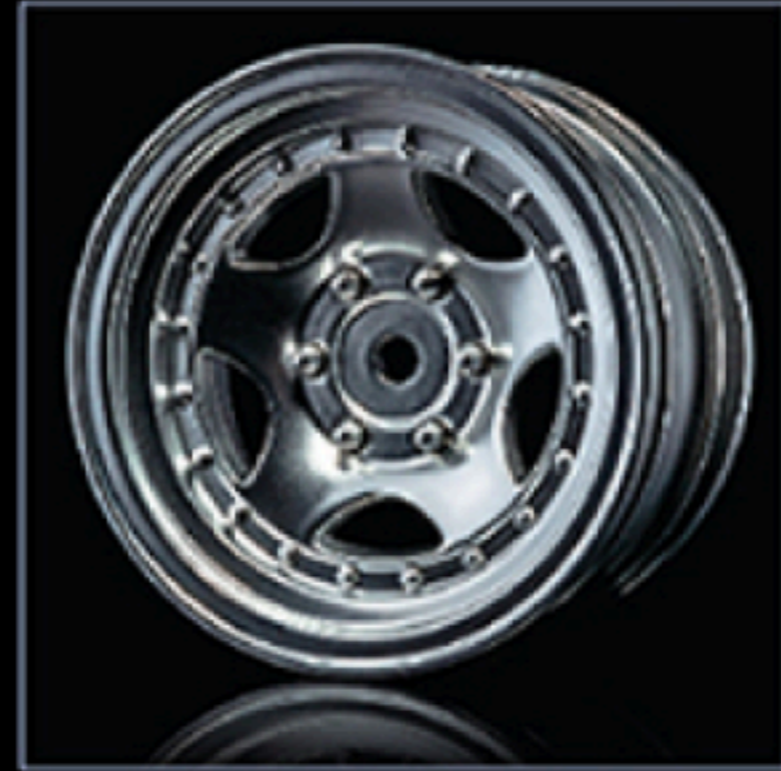
Flat silver 236 1.9" wheel (+5) (4) 消光銀 236 1.9" 輪框 (+5) (4)