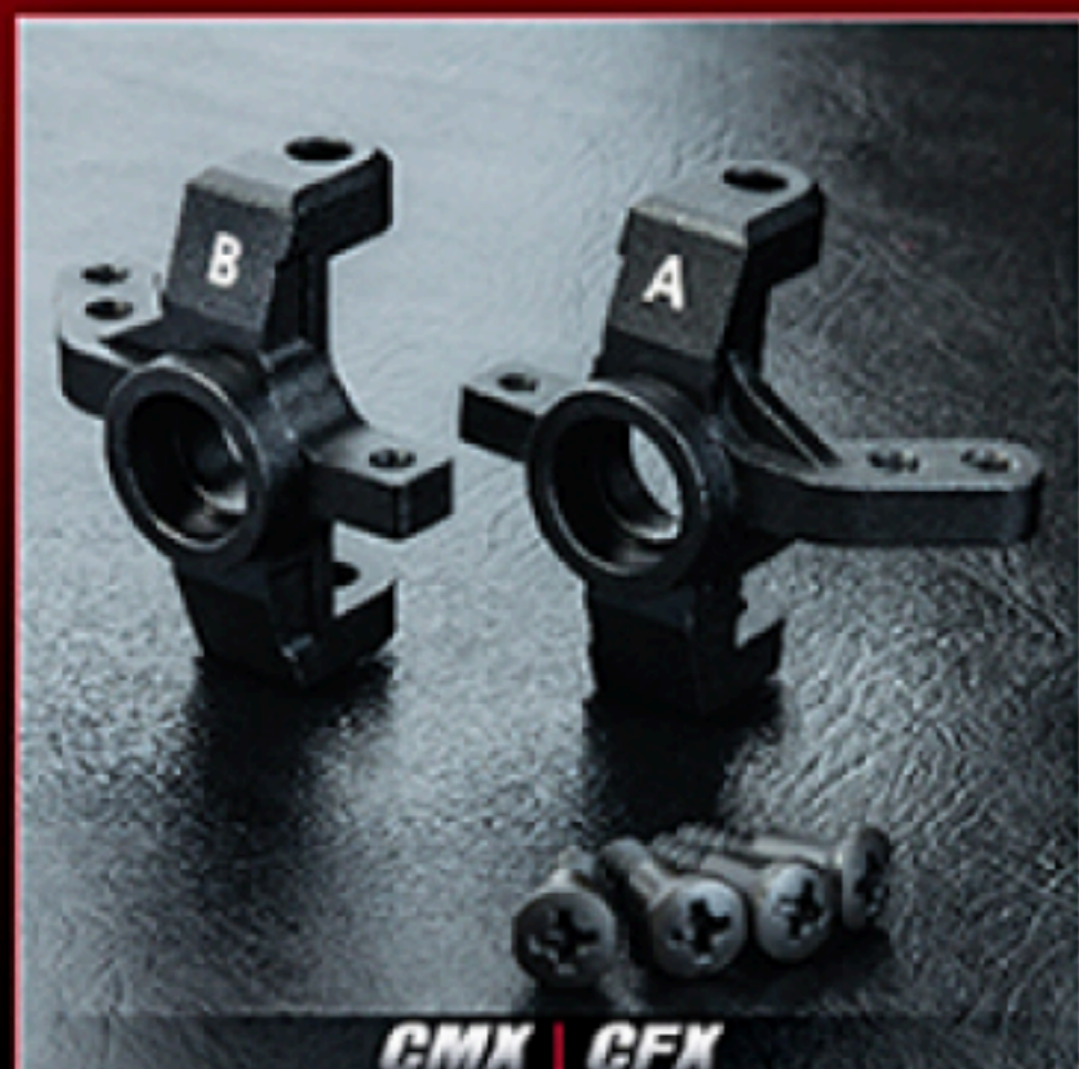
CMX Alum. knuckle (black) CMX 鋁合金轉向輪座 (黑)