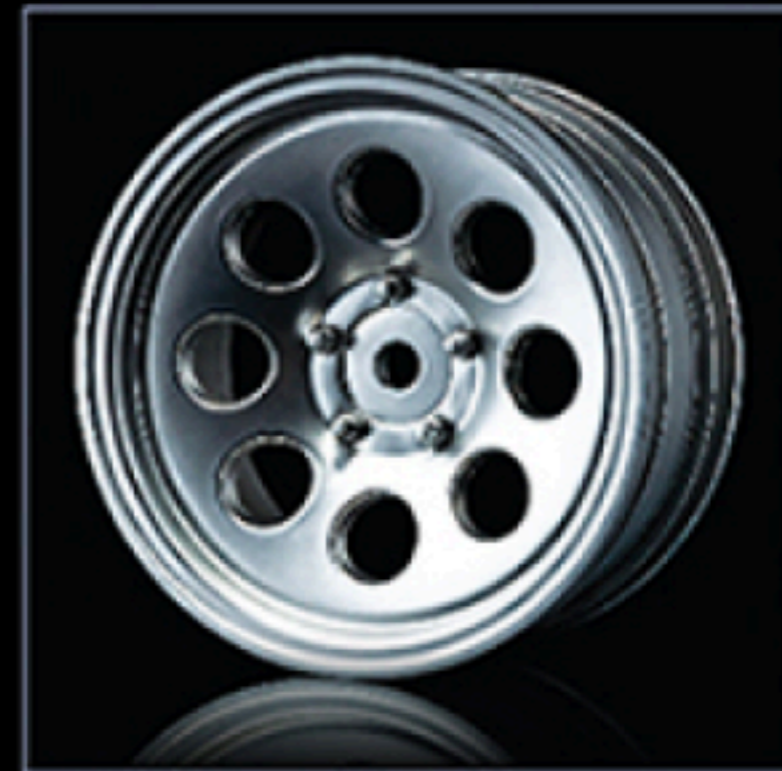
Flat silver 58H 1.9" crawler wheel (+5) (4) 消光銀 58H 1.9" 攀岩框 (+5) (4)