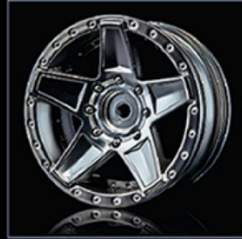
Flat silver 648 1.9" wheel (+5) (4) 消光銀 648 1.9" 輪框 (+5) (4)