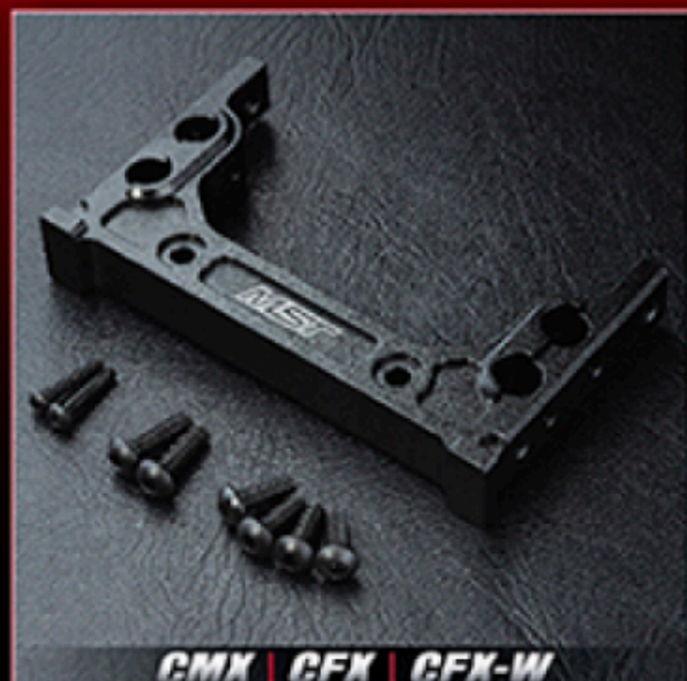
CMX Alum. crossmember A D CMX 鋁合金橫樑 A D