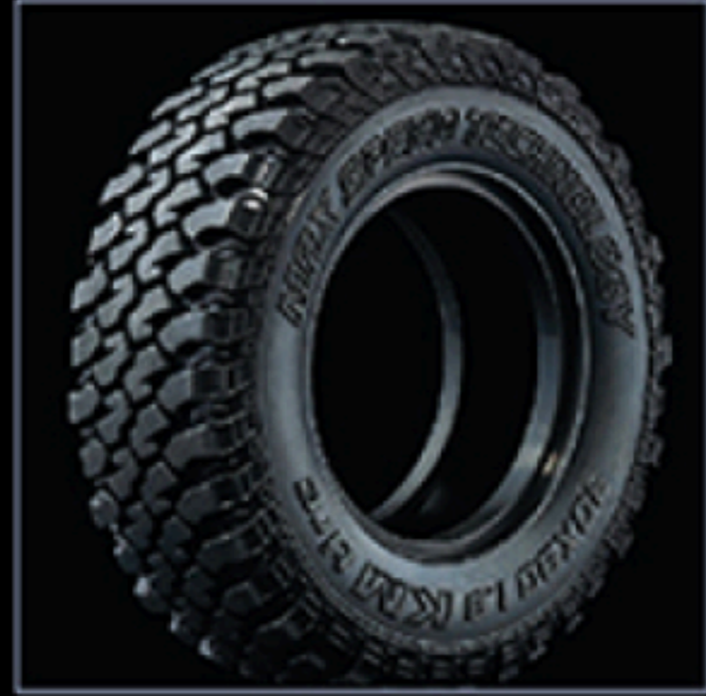
KM Crawler tire 30X90-1.9" (medium-40) (2) KM 攀岩胎 30X90-1.9" (中-40) (2)