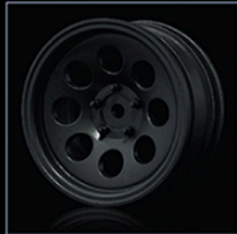
Black flat 58H 1.9" crawler wheel (+5) (4) 黑色消光 58H 1.9" 攀岩框 (+5) (4)