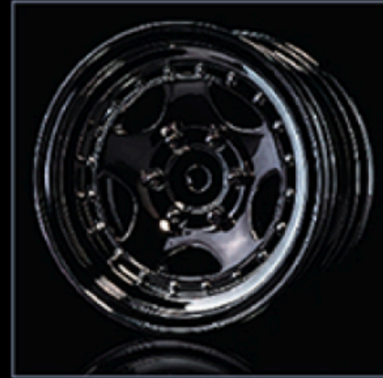
Silver black 236 1.9" wheel (+5) (4) 銀黑 236 1.9" 輪框 (+5) (4)