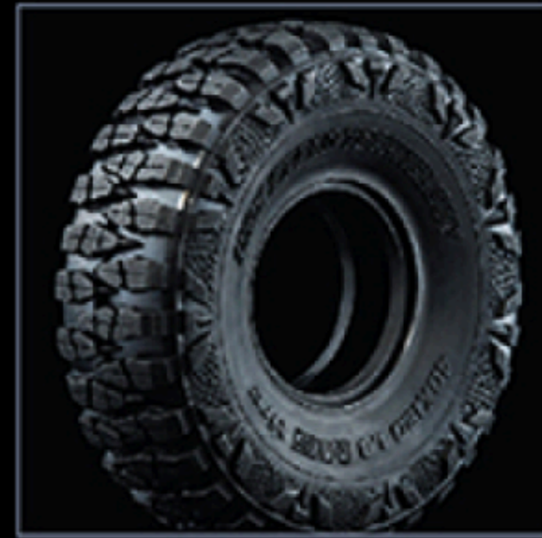
MG Crawler tire 40X120-1.9" (2) MG 攀岩胎 40X120-1.9" (2)