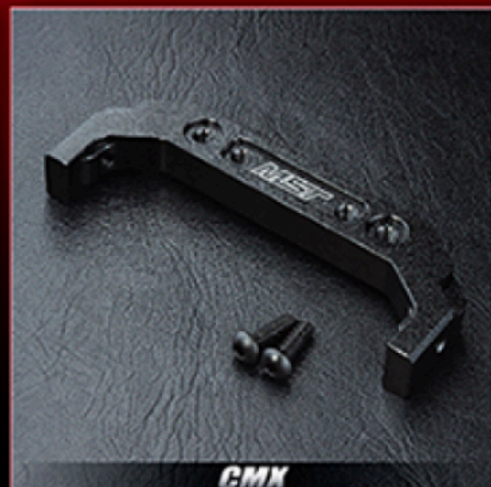
CMX Alum. crossmember B CMX 鋁合金橫樑 B