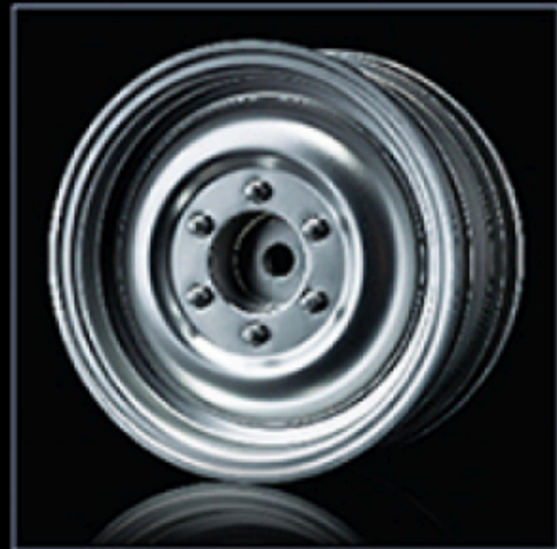
Flat silver 60D 1.9" crawler wheel (+5) (4) 消光銀 60D 1.9" 攀岩框 (+5) (4)