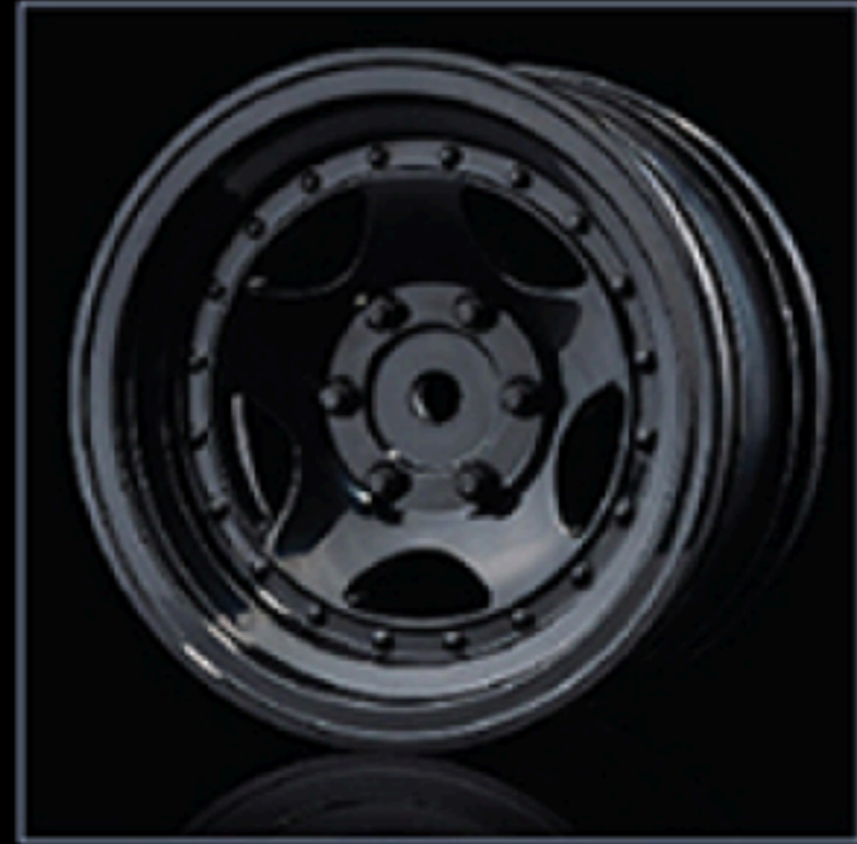
Black 236 1.9" wheel (+5) (4) 黑色 236 1.9" 輪框 (+5) (4)